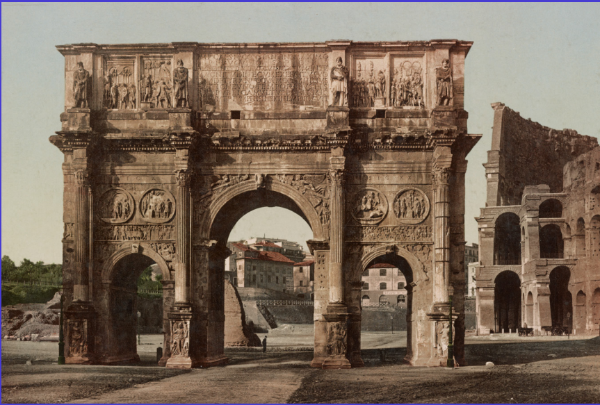
Arch of Constantine, Rome, Italy

Formats OTF, TTF, WOFF, WOFF2, and Variable